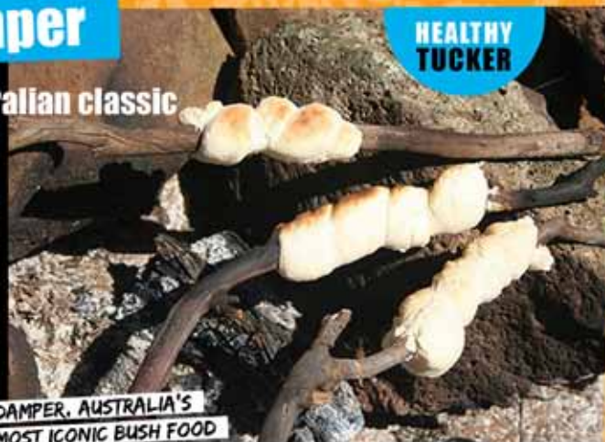
DAMPER, AUSTRALIA'S MOST ICONIC BUSH FOOD

✦ Mix together one large cup of self raising flour, one tablespoon of sugar, two tablespoons of cooking oil, a pinch of salt and enough warm water to make a stiff dough.